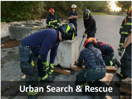
Urban Search & Rescue