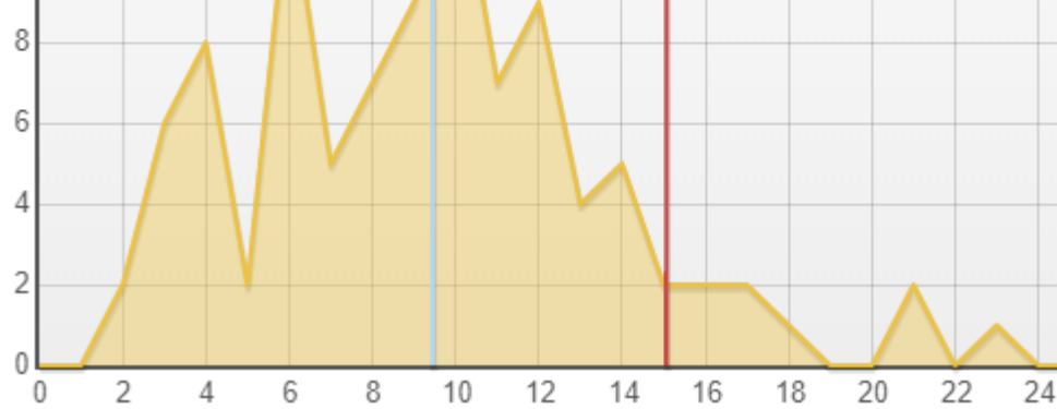
Response Time (mins)